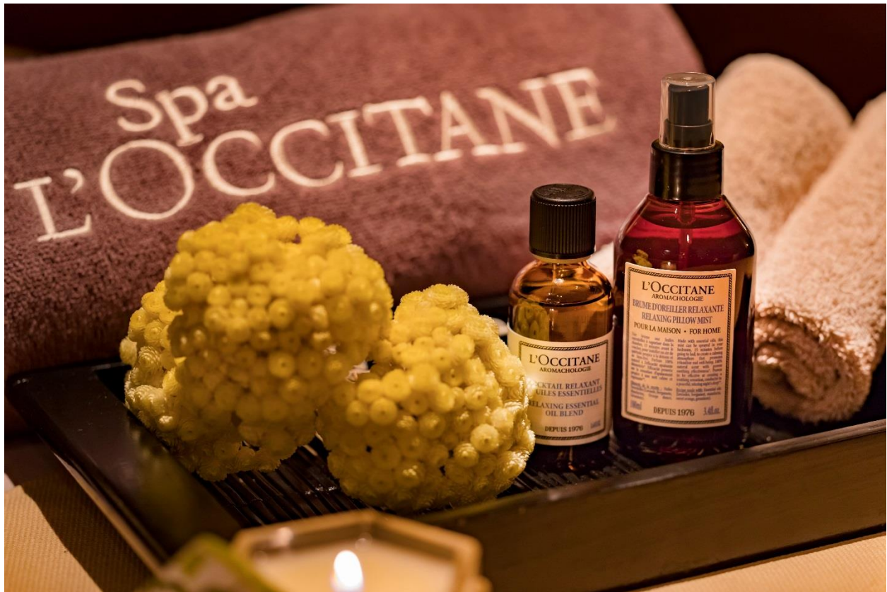
Image Gallery “YU, THE SPA by L’ OCCITANE” at Hotel Chinzanso Tokyo